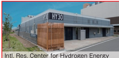
Intl. Res. Center for Hydrogen Energy (Residential Fuel cell system)