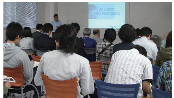
Safety training course for researchers and students in advance of experimental works

At Ito Campus, while we work on various research projects related to hydrogen energy, emphasis is given to the safety management for flammable hydrogen gas. Facilities so far installed include safety infrastructure with hydrogen supply and exhaust systems using sensors and alarms. We also have various safety measures against gas leakage, such as a mechanism to shut off the hydrogen gas supply at the outlet of the hydrogen storage cylinders, as well as a cut-off mechanism for the power supply to the experimental instruments. Our safety management system also integrates all possible safeguards in terms of software. We have a full-time safety manager in the Division for High-Pressure Gas Safety of the Office for the Promotion of Safety and Health, and qualified persons with long-term experience who are specialized in high-pressure gas production and maintenance are stationed 24 hours a day as safety technicians. As the education on safety is one of the important missions of the research center, students, faculty members and other university staffs who use the facilities of the International Research Center for Hydrogen Energy are obliged to attend annual training programs on hydrogen safety. Another tool used to create a safe environment for experiments is the "near-miss report," which must be submitted whenever a minor incident occurs. This information is shared by all parties concerned, and countermeasures are discussed at monthly meetings for safety and health.