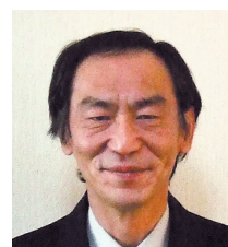
Head of the Division for High-Pressure Gas Safety, Office for the Promotion of Safety and Health, Kyushu University