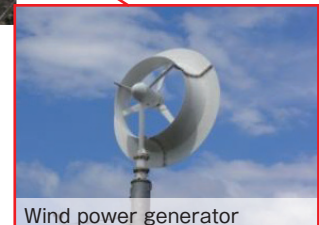
Wind power generator