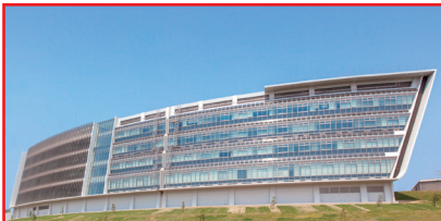
International Institute for Carbon-Neutral Energy Research (I 2 CNER) Next-Generation Fuel Cell Research Center

Kyushu University has constructed a world-leading educational and research center, with over 300 researchers and graduate students and more than 13,000m 2 of research space at the Ito "Hydrogen Campus." Taking advantage of the 21 st Century COE Program, this campus plays a central role in the university's "Energy Campus" concept. In addition, by collaborating with the Fukuoka Strategy Conference for Hydrogen Energy, an academic-industrial promotion organization with more than 500 member companies and businesses, we have created an environment where young researchers can closely exchange ideas and information with engineers in the industry. The campus is also a place where young researchers can experience various technological innovations, and where the uses of fuel cell technology can actually be demonstrated, making the best use of all the facilities on the campus, including the hydrogen station.