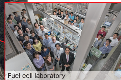
Fuel cell laboratory