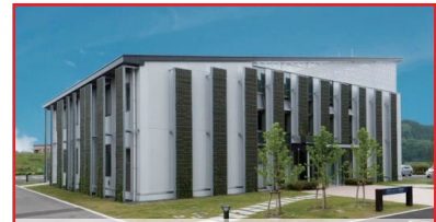
Future Energy Demonstration Facility