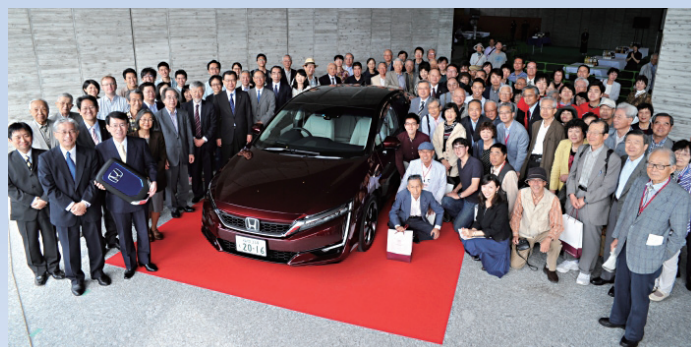
The delivery ceremony of a “Honda Clarity Fuel Cell” vehicle.